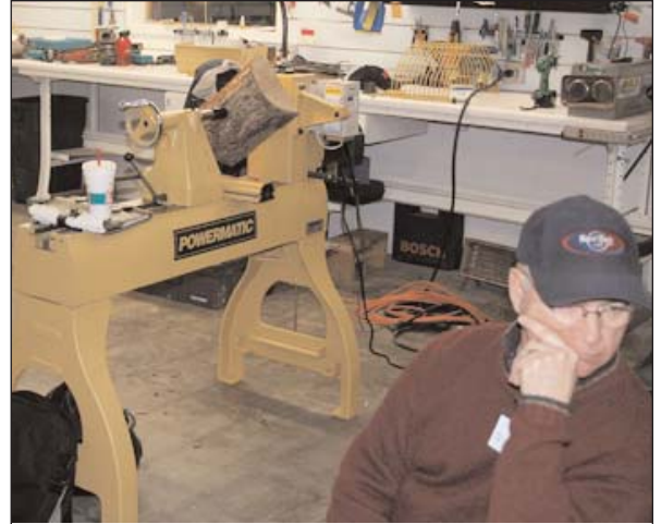
The wood just atalkin', the new NWT lathe just asittin', next month's demonstrator just alist'nin'

We're looking to add more and more pictures to our Gallery pages. Turn 'em and bring'em! Everyone enjoys seeing others' work. That's part of why we're here, to observe, to learn, to share.