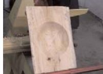
The Final Shape