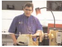
Discussing the Shape