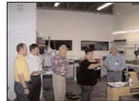
Thanks to the 2005 chapter officers. Sorry for the size. Very low-res picture.