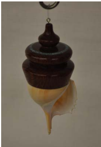
1st Place Bruce Stevenson

After a 3-way tie for 2 nd place we had a run off that resulted in a 2-way tie. We finally came up with the following winners: