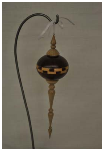
2nd Place Harlan Henke