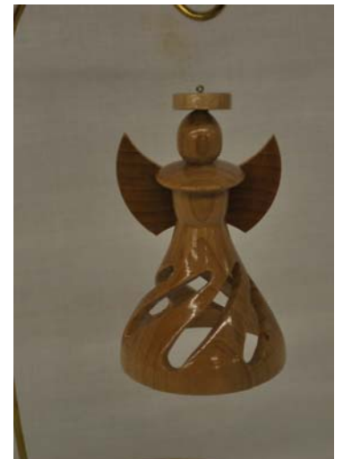
3rd Place Chip Siskey