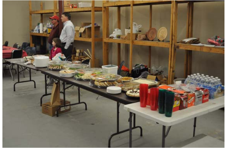
Plenty of food and fellowship