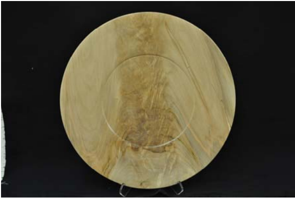
Kent Townsend's Ambrosia Maple Platter and Walnut lidded box.