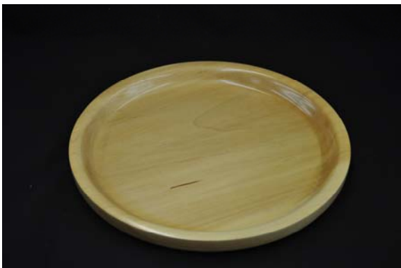
Lester Gillett's Maple plate and home-made buffing wheel set.