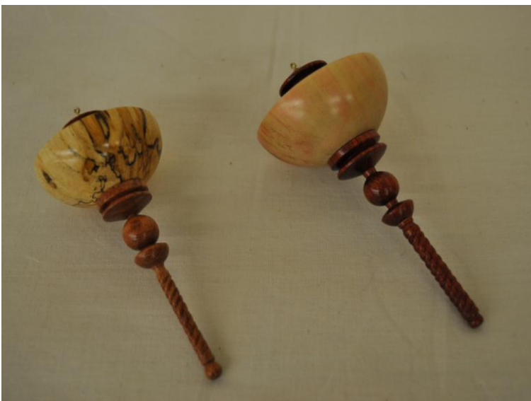
Ornaments with spiral cut finials by Chip Siskey