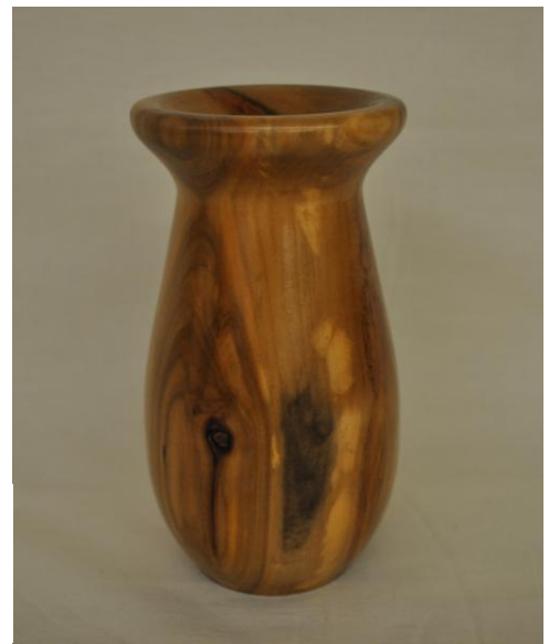
Dale Pollard's vase (wood unknown)