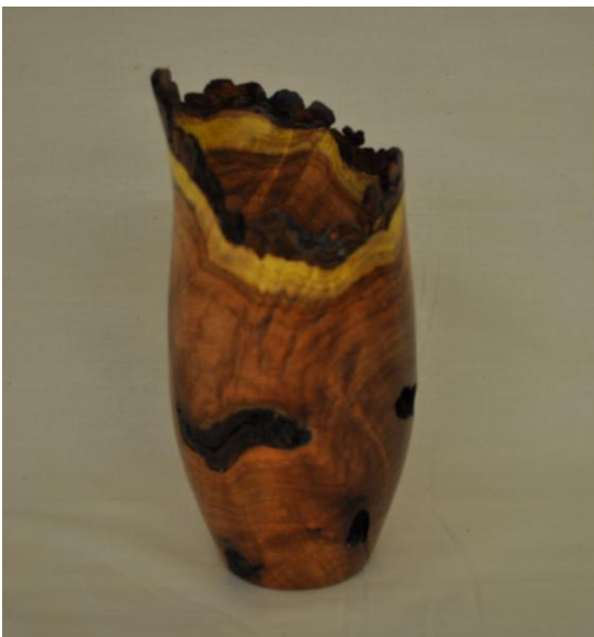
Kent Townsend's Mesquite vase