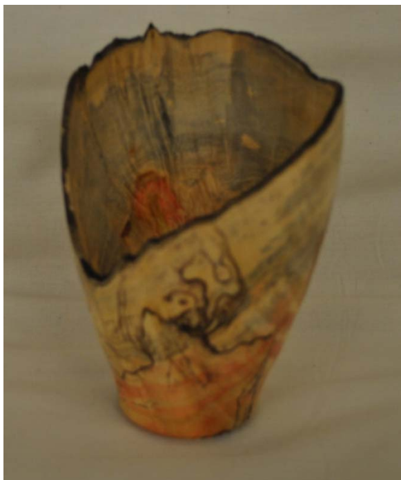
Box Elder Vase by Chip Siskey