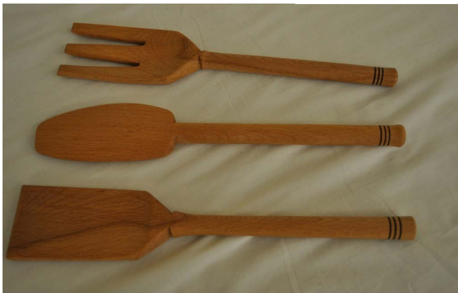
Dave Halter's Kitchen Utensils