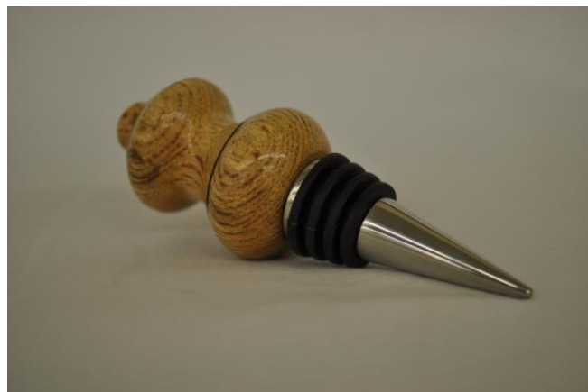
Black Jack Oak bottle stopper with black embossing powder by Dale Pollard