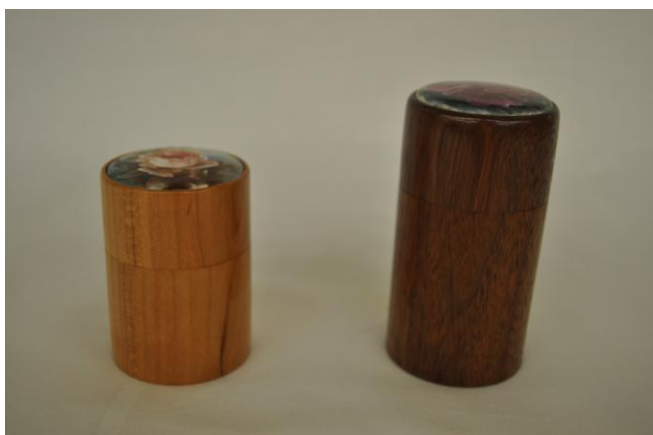
Cherry box and Walnut box by Andy Brundage