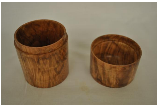
Kent Townsend's Camphor box