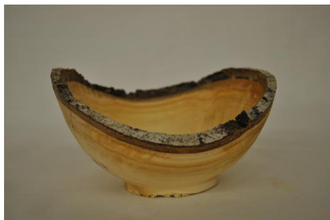
Chip Siskey's natural edge Birch bowl