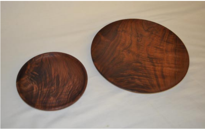
Black Walnut platters by Vince Robinette