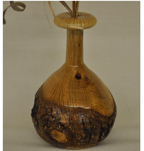
Dale Pollard's Black Jack Oak weed pot