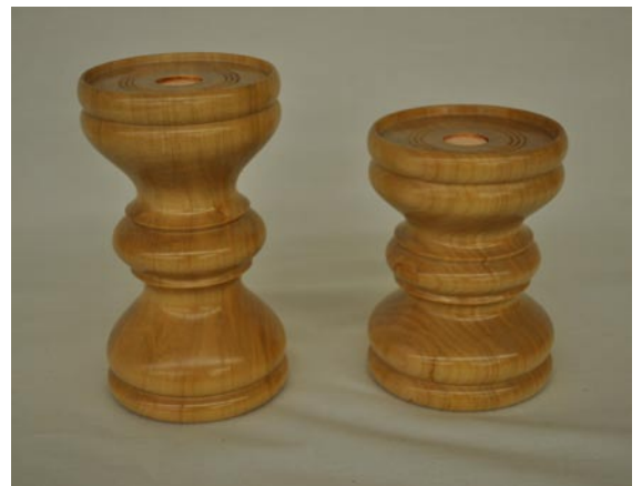
Maple candle holders by Harlan Henke