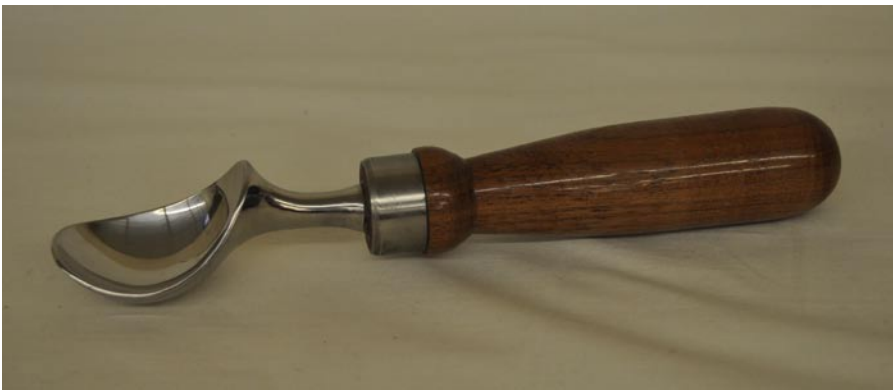
Walnut ice cream scoop by Don Mahaffy