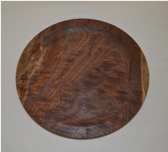
Curly Walnut platter by Vince Robinette