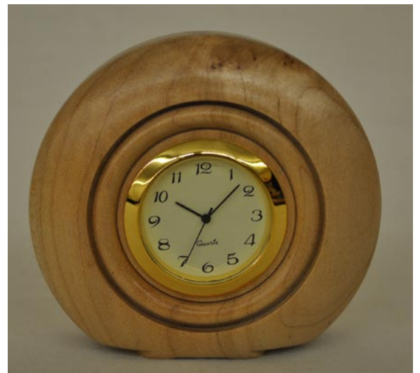
Chip Siskey brought this Mulberry natural edge bowl and this desk clock