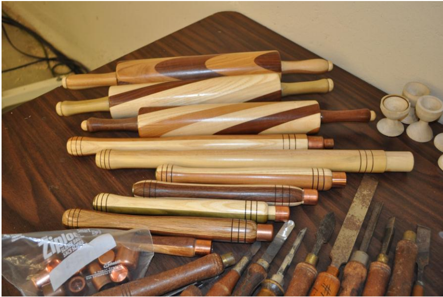
Don Heese brought these rolling pins and tool handles.