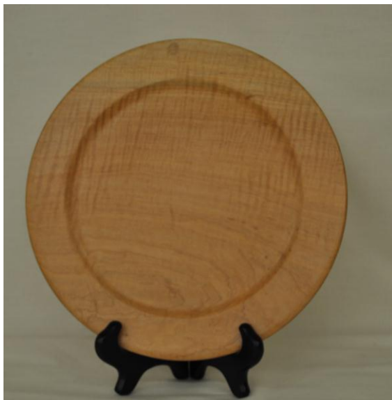
Kent Townsend's curly maple platter.