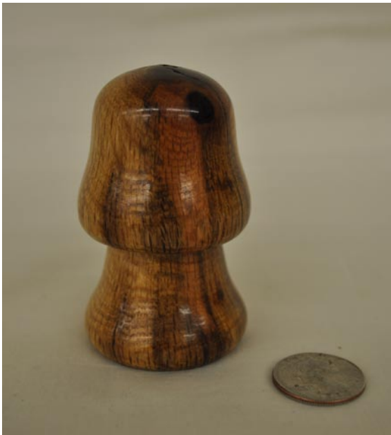
Blackjack Oak mushroom by Dale Pollard