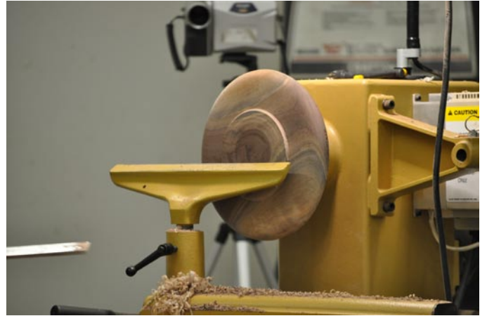
Some examples of presenter Vince Robinette's handiwork