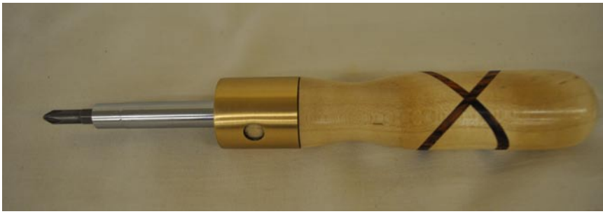
Screwdriver by Chip Siskey