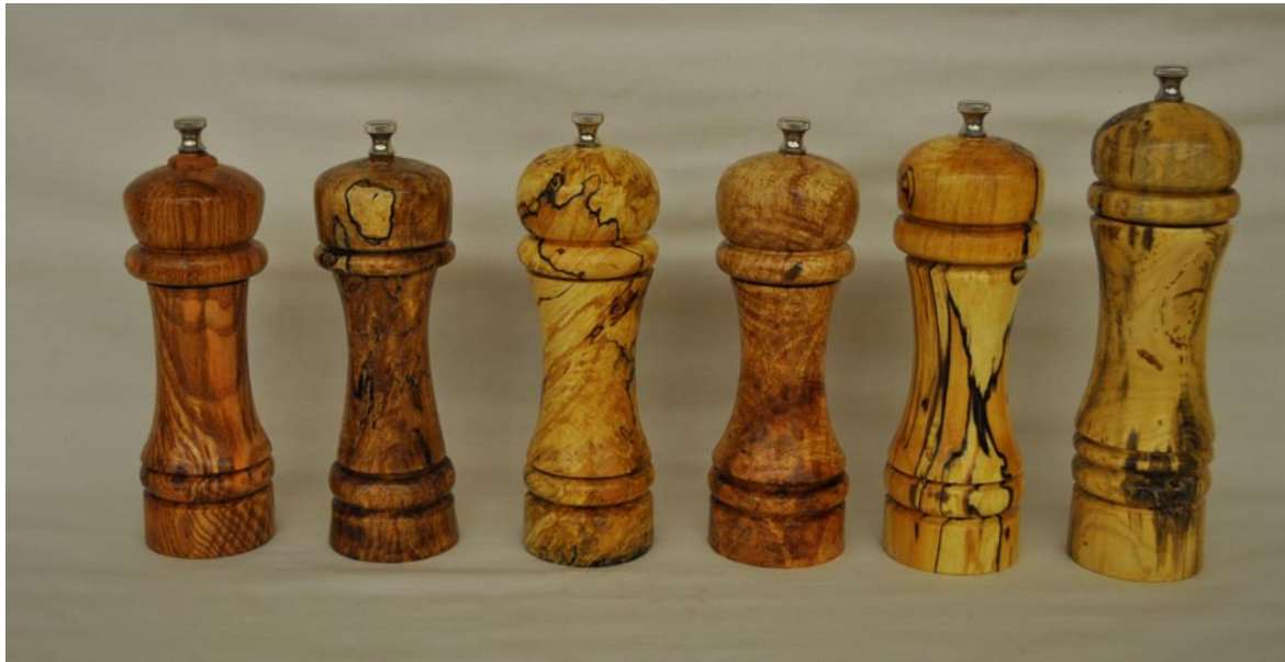
Pepper grinders by Larry Cory