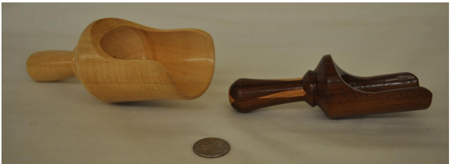
Dale Pollard brought two scoops.