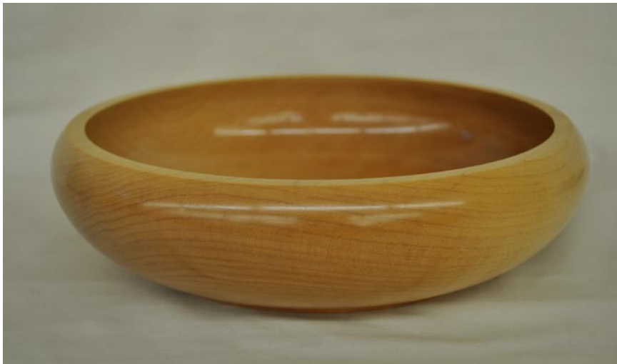
Chip Siskey brought a Banksia pod vessel (upper left), a captive ring goblet (above) and a maple salad bowl (left).