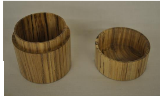
Kent Townsend's Hackberry box