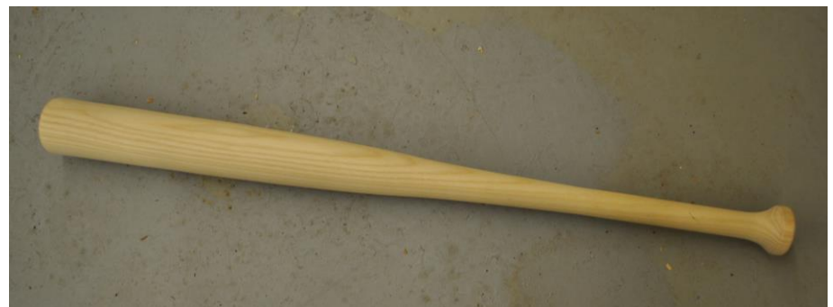
Dwight Herrick brought this Ash baseball bat for Show & Tell