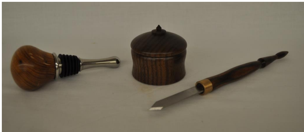
Bottle stopper, walnut lidded box and marking gauge by Wayne Peterson.