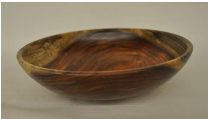
Kent Townsend brought these two pieces; a rosewood bowl (above) and a large ambrosia maple bowl (right).