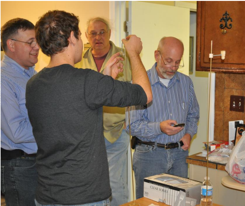
Slow race thing-a-ma-jigs