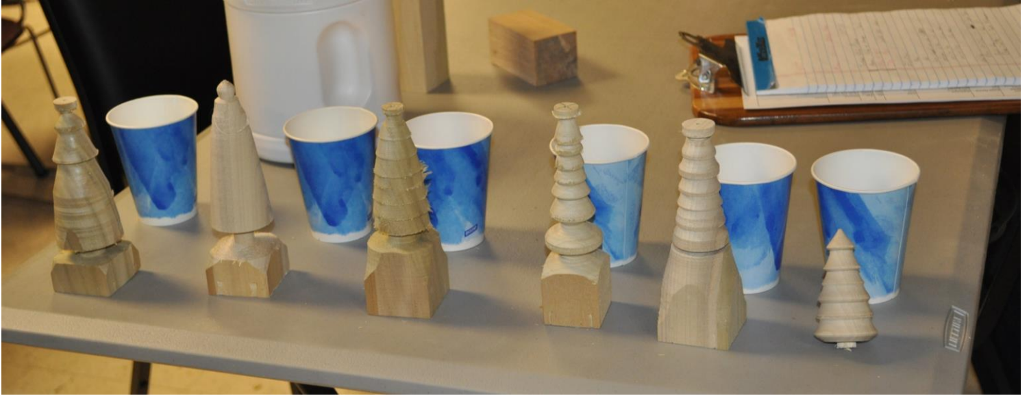
Timed Christmas tree entries