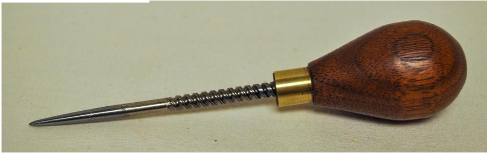
Stephen Campbell made a small with a walnut handle. The awl point was ground from a worn out masonry bit.