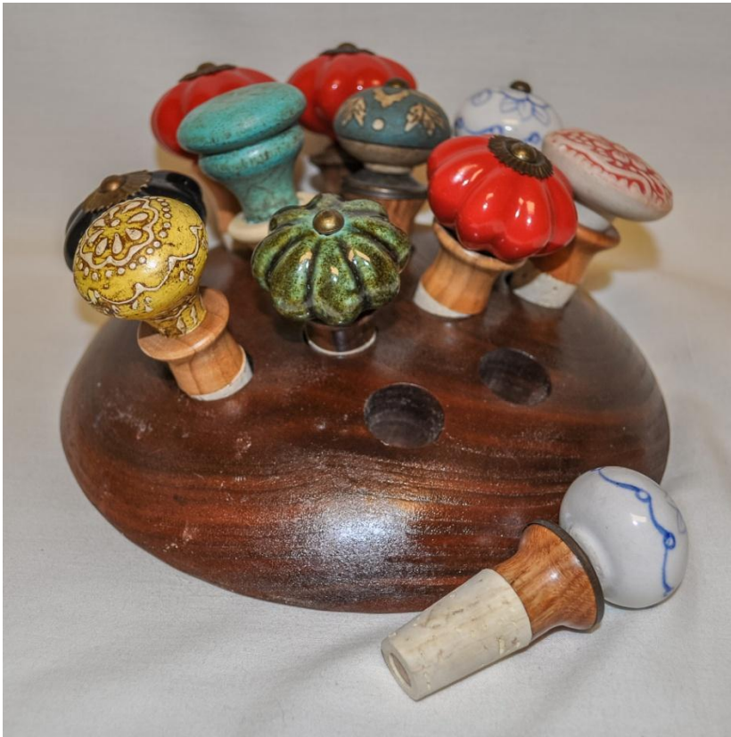
Kent Townsend brought in several bottle stoppers made from drawer pulls in a walnut stand.