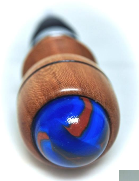
Walnut bottle stopper with glass marble insert by Bill Manley.