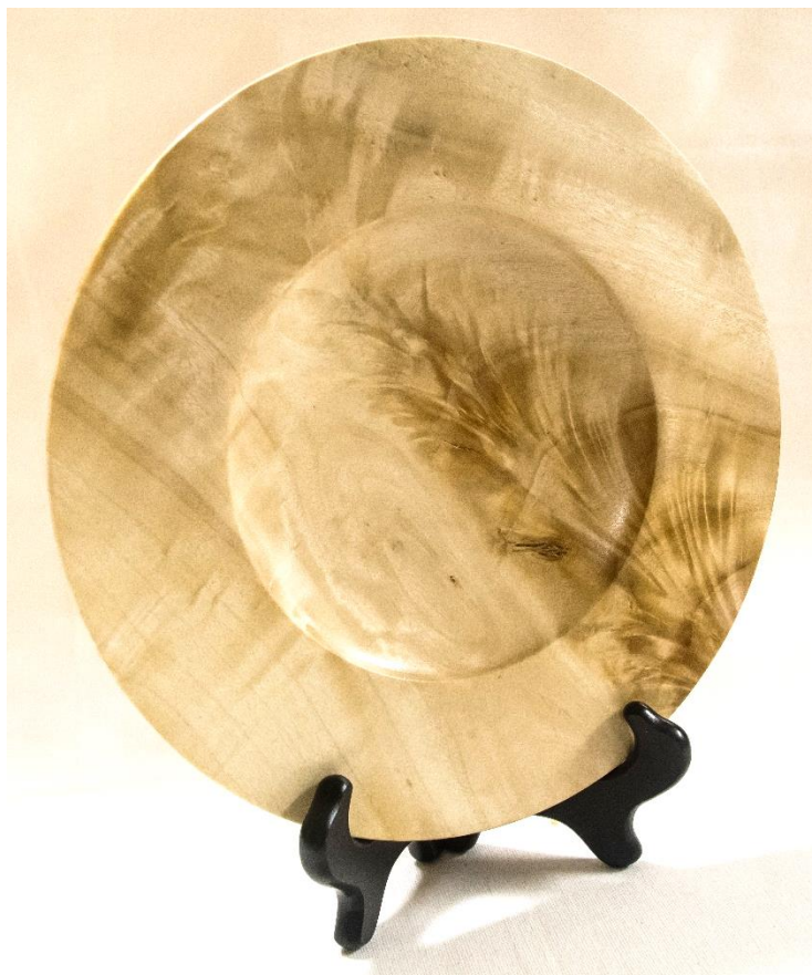
Mormon Poplar Platter and nested bowls turned by Kent Townsend.