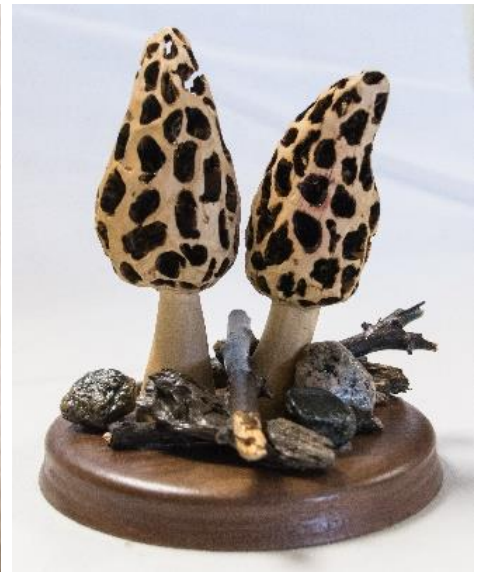
Morel Mushrooms on Walnut Stand turned and carved by Kent Townsend