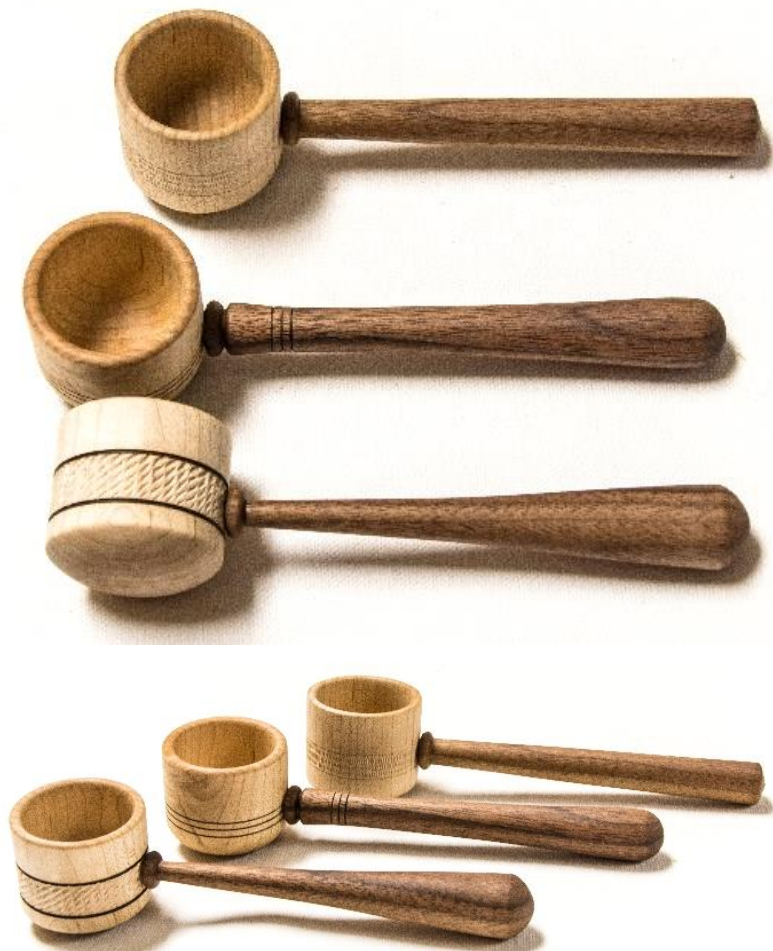
Maple and Walnut Coffee Scoops turned by Dave Halter