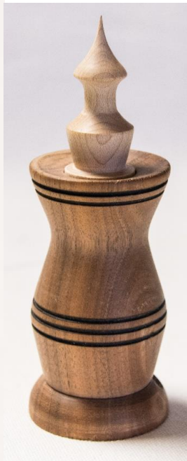
Walnut and Maple Box and Homemade Point Tool set presented by Bruce Stevenson