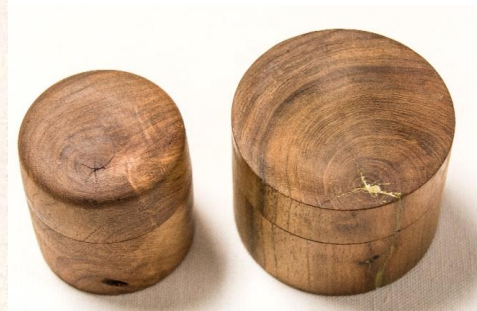
Kent Townsend presented Mesquite and Walnut Boxes with brass inlay. Finished in "Woodturner's Jelly"