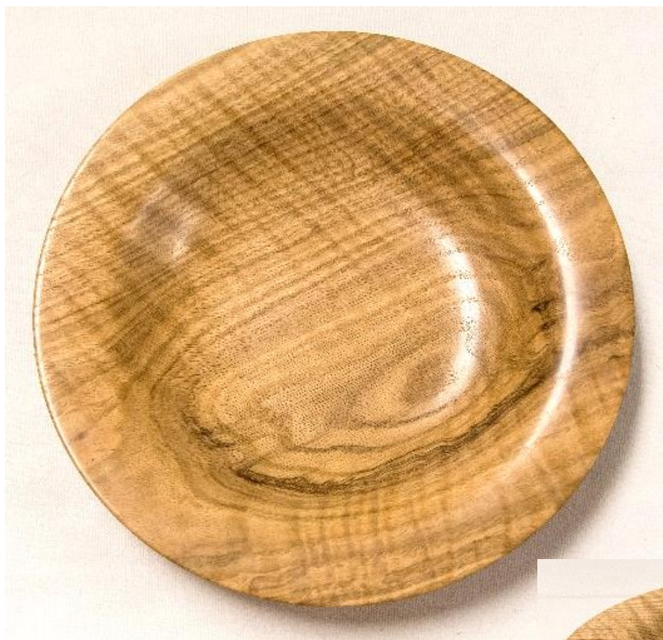
Oak Platter turned by Jim Tate.