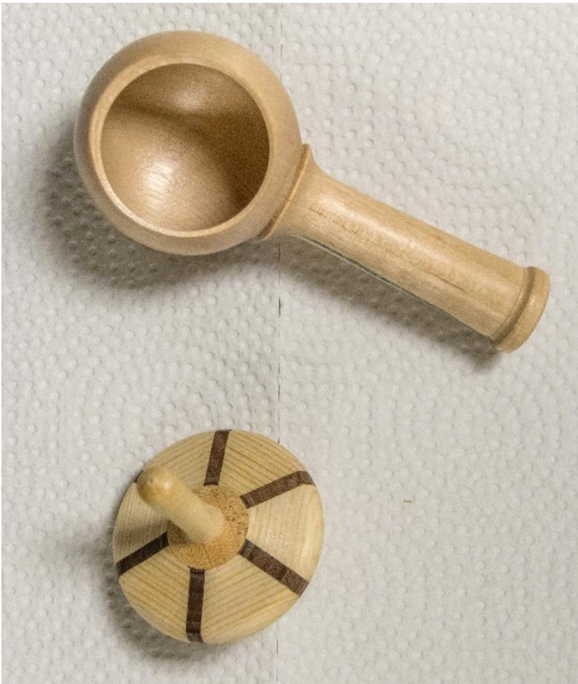
Scoop and Top by Jim Tate