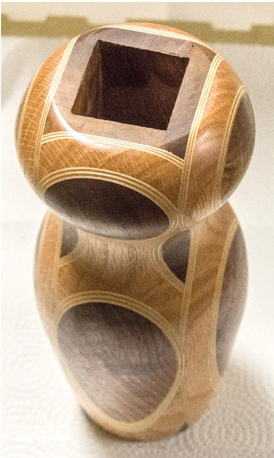
Walnut and Oak Bowl and Vase turned by Dale Pollard