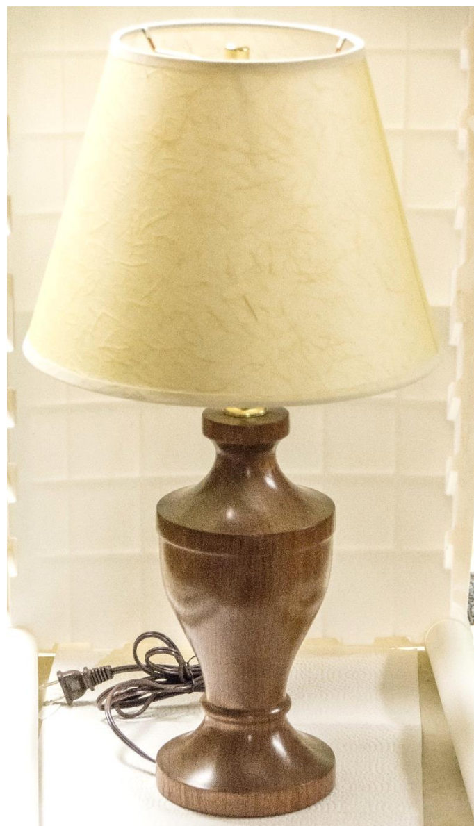
Walnut Lamp, Quilt Hangers, and Drill Bit Extension by Harlan Henke